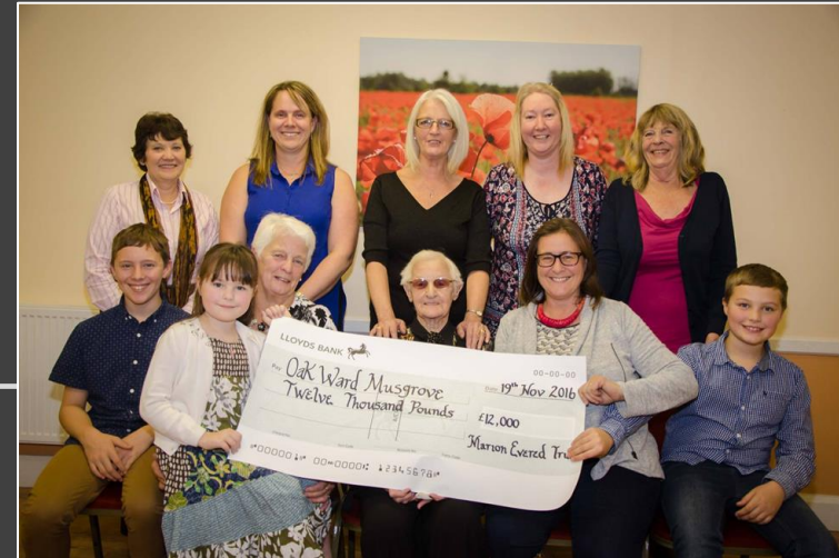
THE TRUST PRESENTING A CHEQUE TO MUSGROVE PARK HOSPITAL IN 2016