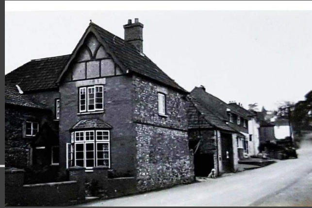
THE OLD FIRE STATION IN CASTLE STREET